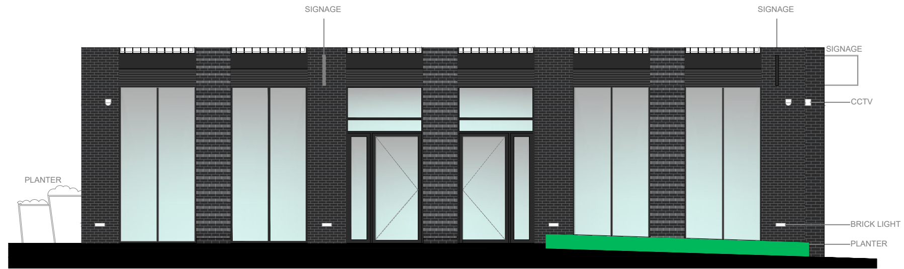
01 EXISTING ELEVATION 1 Scale 1:100